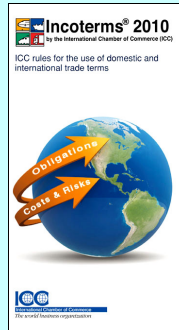
ICC Pub. No 715E | 128 pages Size: 13cm x 24cm